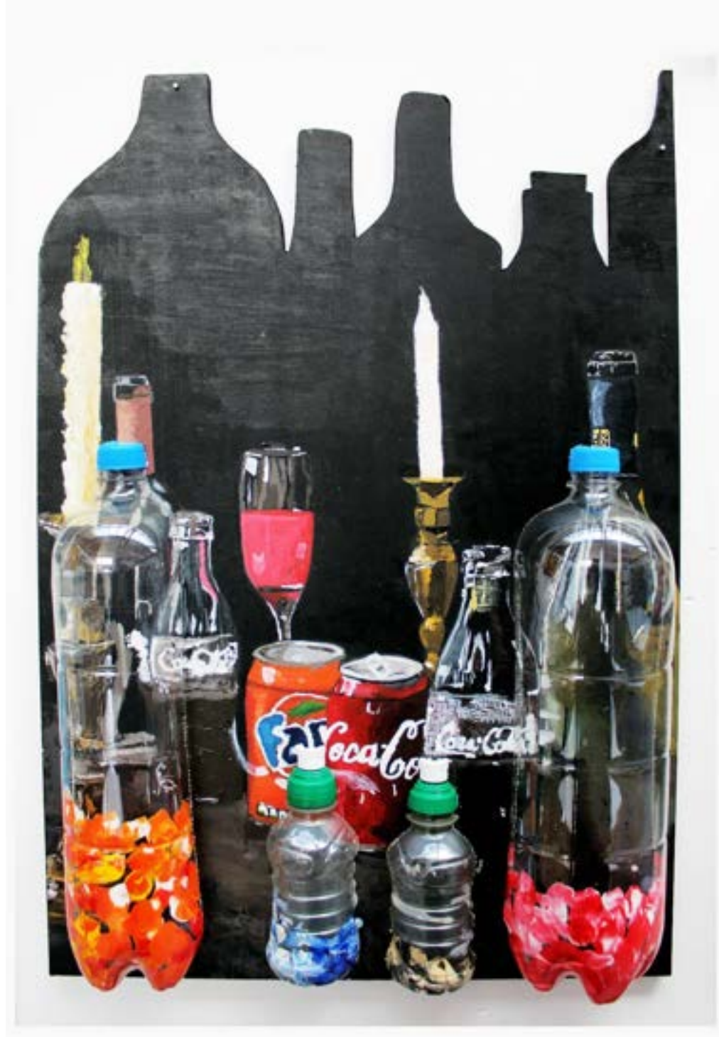
Theodore Harewood - GCSE Portfolio 2022