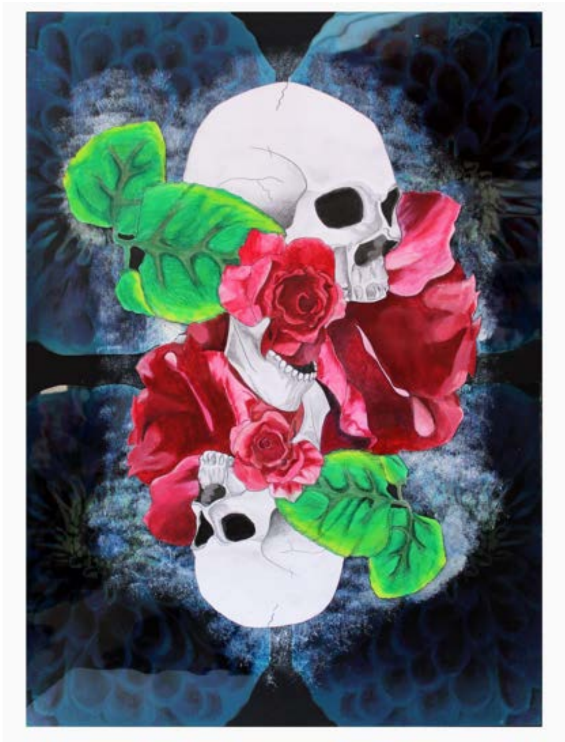
Shyam Ghaghda - GCSE Portfolio 2022