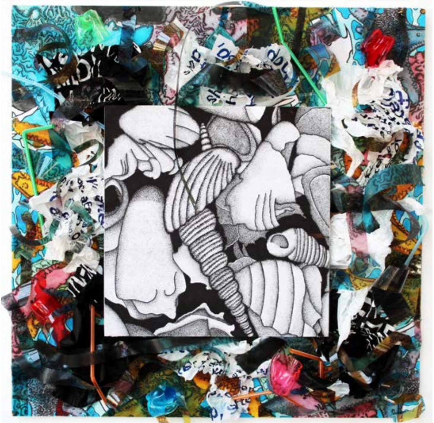
Freddie Chattaway - GCSE Portfolio 2022