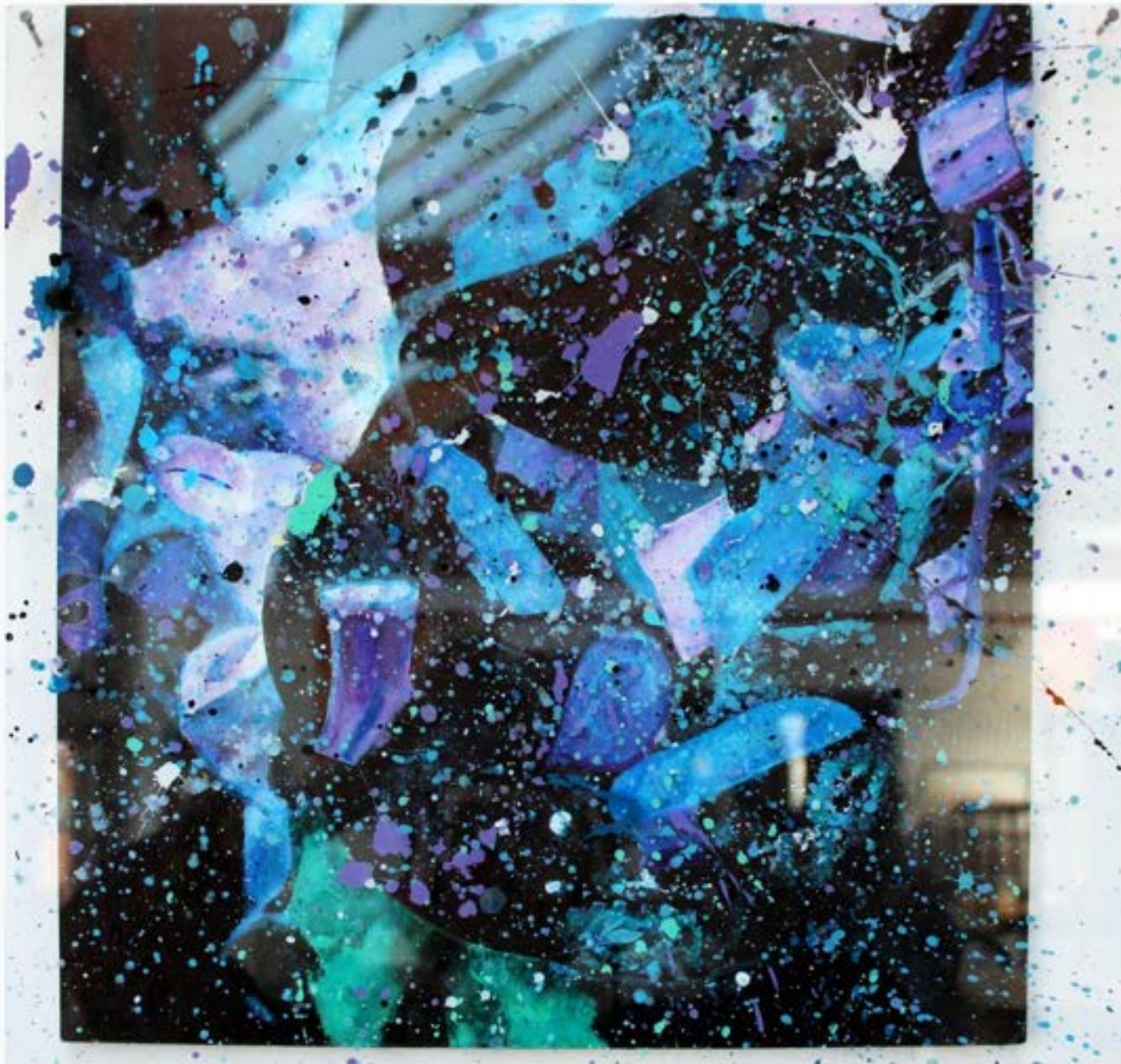
Jayden Jethwa - GCSE Portfolio 2022