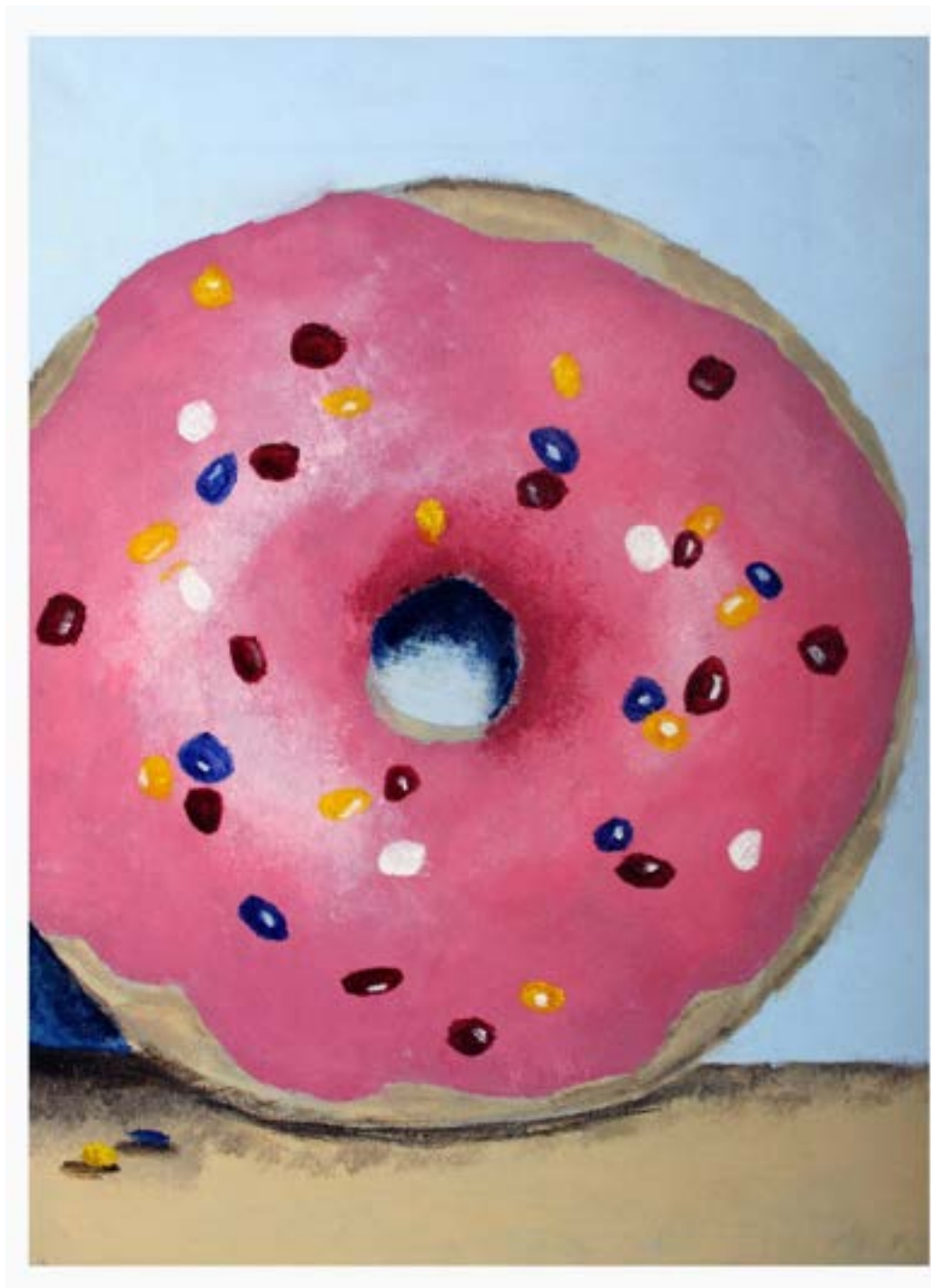
Tristan Butt - GCSE Portfolio 2022