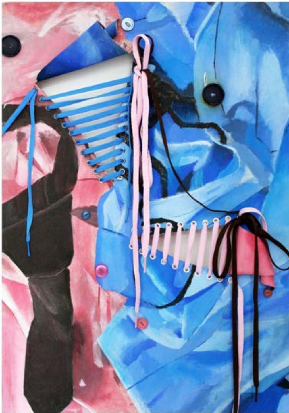
Monty Lawrance - GCSE Portfolio 2022