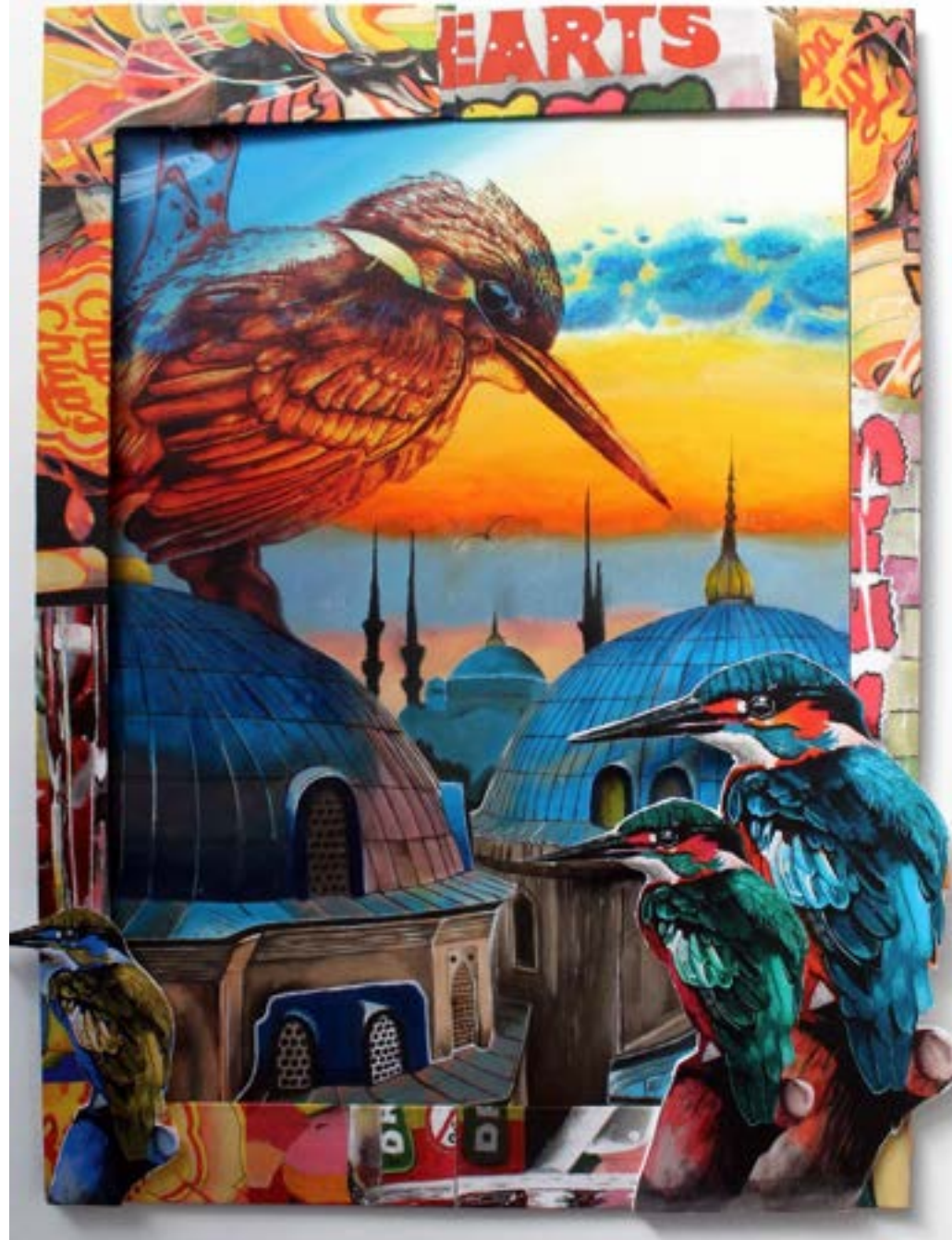
Ahmed Taimoor - GCSE Portfolio 2022