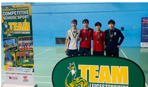
LGS Key Stage 5 Badminton Winners

These amazing results mean that both Grammar School Teams are now Regional Champions and will progress to the National Finals at the National Badminton Centre next month.