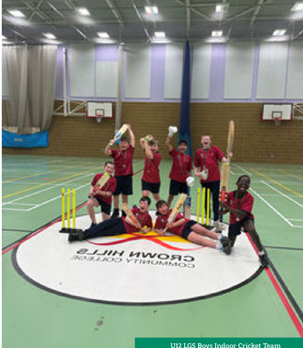
U12 LGS Boys Indoor Cricket Team

We are now working up to a busy Summer term of cricket and have a lot to build on moving forward.