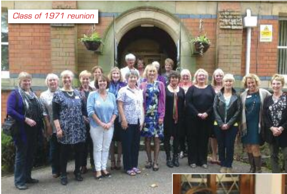
Class of 1971 reunion