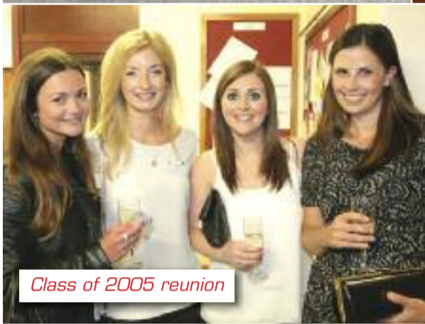
Class of 2005 reunion