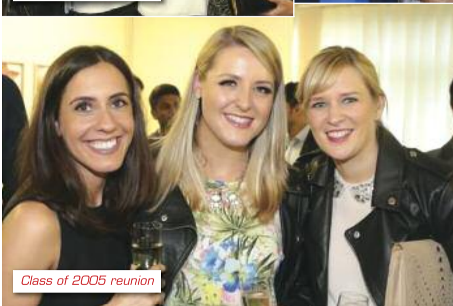
Class of 2005 reunion