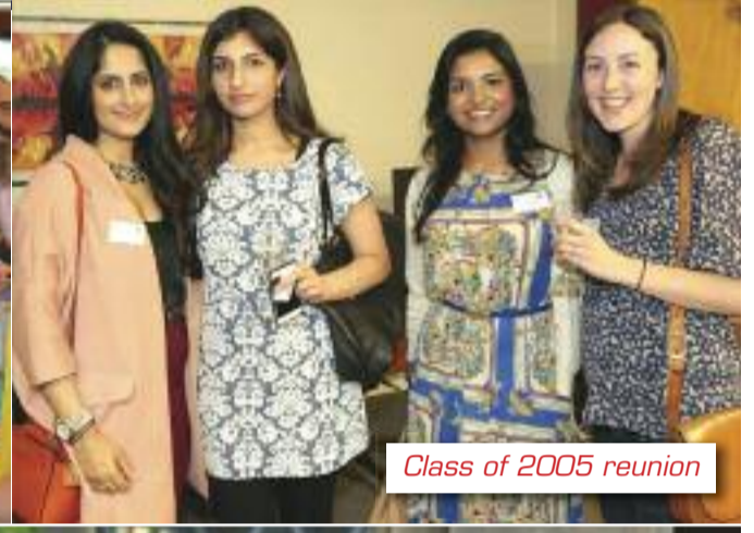
Class of 2005 reunion