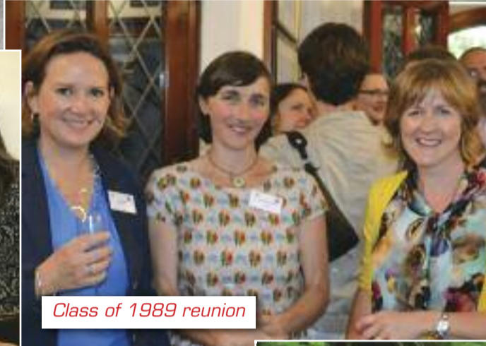
Class of 1989 reunion