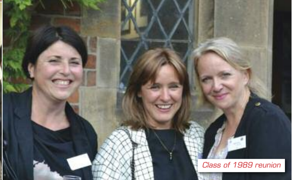
Class of 1989 reunion