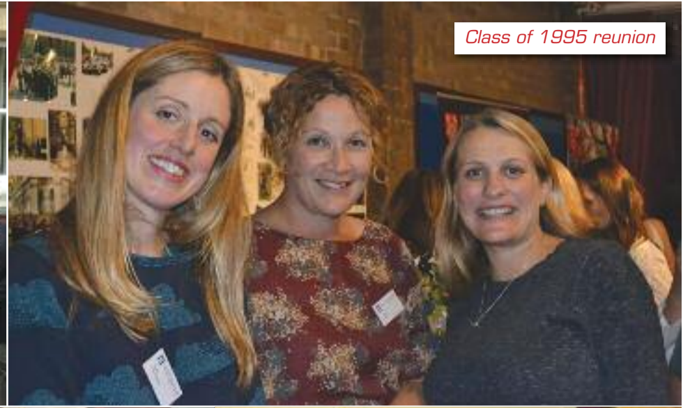
Class of 1995 reunion