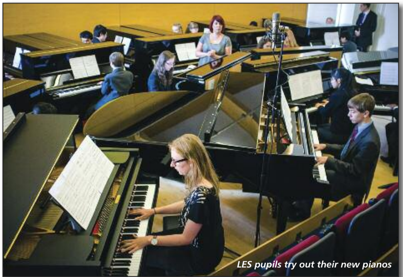
LES pupils try out their new pianos

Over the past eighteen months, we have been overwhelmed by the generosity of pupils, former pupils, parents, grandparents and friends of the Music School, who have helped and supported us in our fundraising appeal. Having planned to buy a new grand piano for the Recital Hall, we were amazed by the response to our appeal, which enabled us to go even further and provide new pianos throughout the Music School and beyond. We are extremely grateful to all donors, particularly the support given by the former Old Girls' Association, who have given so generously.