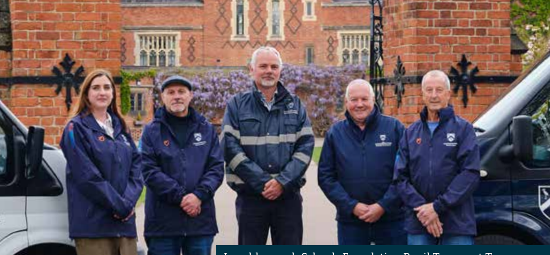
Loughborough Schools Foundation Pupil Transport Team

For many years Roberts have been operating and managing home to school transport for schools across Leicestershire. Their vehicles are tracked and can be monitored, along with driver performance, ensuring Roberts have a clear oversight of all their services.